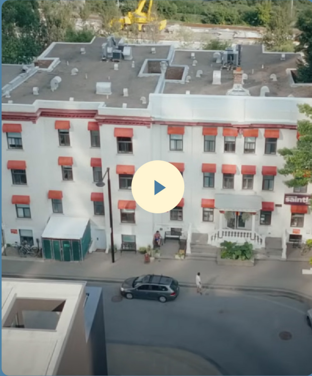
Auberge Saintlo Montréal (English subtitles available)