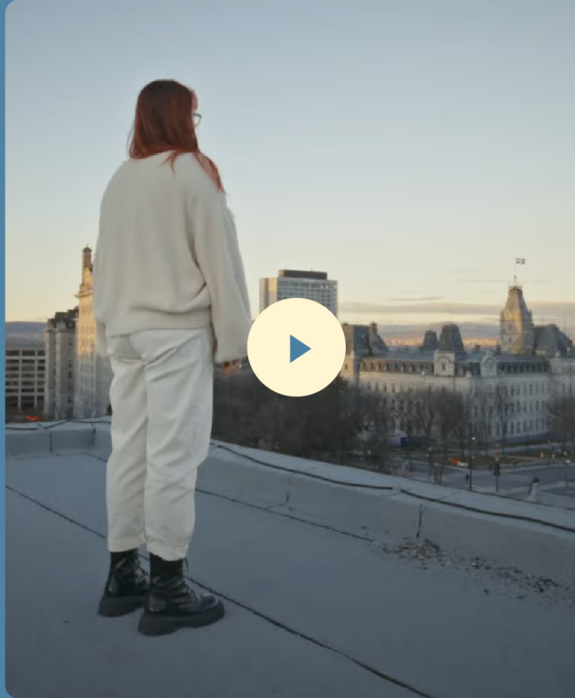
Hôtel Château Laurier Québec (English subtitles available)